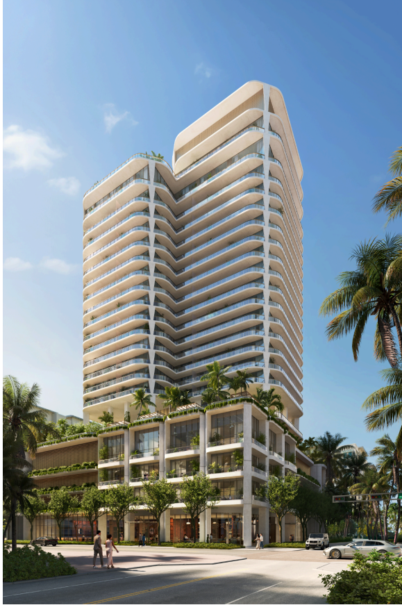
The OMA-designed tower.