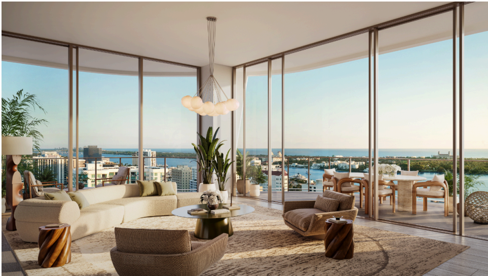
The great room.