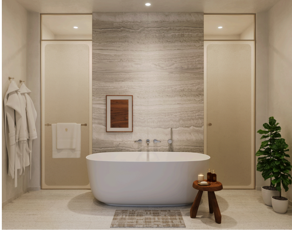
Yabu Pushelberg will design the interiors.

https://robbreport.com/shelter/new-construction/banyan-tree-west-palm-beach-residences-1237698958/