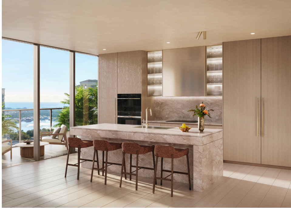
The kitchens will pair warm wood cabinetry with stone surfaces.

You're seeing it everywhere. Projects like South Flagler House have pushed pricing into the stratosphere, while newer developments like the Ritz-Carlton Residences, Olara, Forté on Flagler, and Alba Palm Beach are reshaping the waterfront skyline. Even boutique plays like Maison d'Or lean into more curated, experience-driven living. And with Stephen Ross doubling down with his next project, Edgeworth , it's clear this isn't a short-term boom.